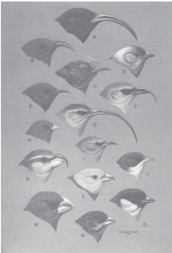
Variations in bill morphology of selected Hawaiian honeycreepers (Illustration: H. Douglas Pratt, Jr.)

Adaptive radiation is often thought of as being driven by the need or opportunity for plants or animals to live in habitats other than the ones to which they are best adapted. It is easy to see how such needs and opportunities could arise for birds arriving on the Hawaiian Islands from other parts of the world. The Hawaiian honeycreepers evolved into species with different primary food sources: nectar, hard seeds, soft fruit, and insects and larvae. Some honeycreeper species have diets made up of combinations of these food sources.