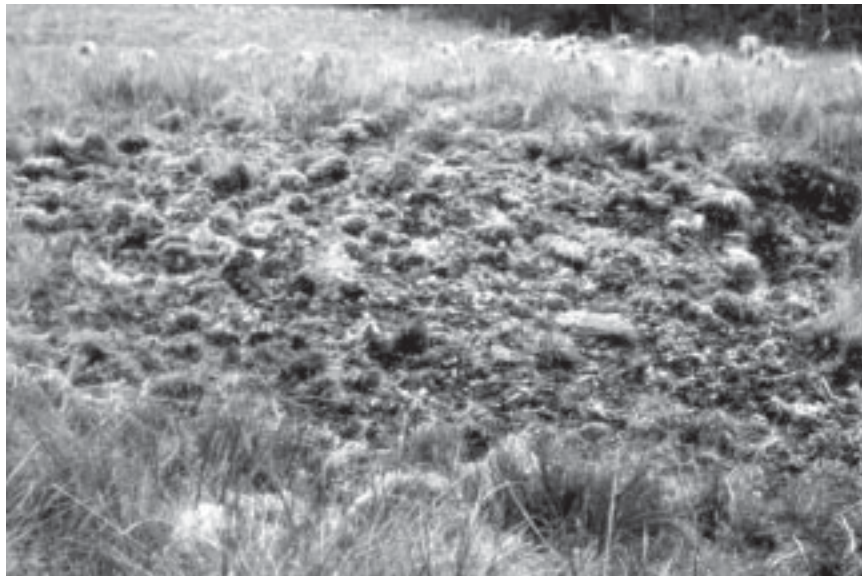
Pig damage in a bog

Greensword Bog was named for the Maui greensword—a relative of the ‘āhinahina (Haleakalā silversword)—that grew in and around the bog. But in June 1981, there were no greenswords to be seen in the bog. In fact, there was very little vegetation of any sort left in the central part of the bog.