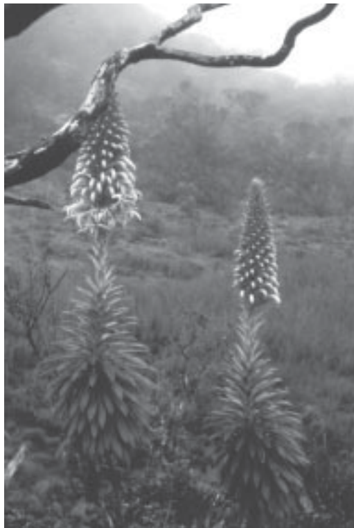
Lobelia gloria-montis grows at the drier margins of bogs, in the rain forest, and on ridge lines. It forms flowering spikes as tall as 4 meters (13 feet).

When pigs feed in the rain forest, there is no mistaking that they have been there. Large areas may look like a rototiller has gone through,