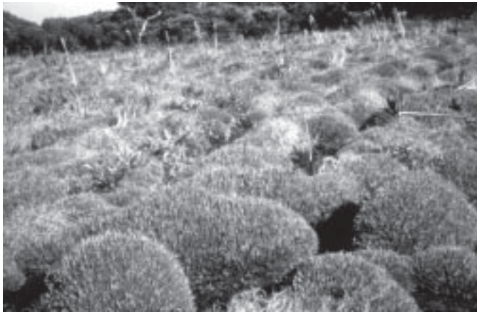
An Oreobolus bog in its natural state

Bog plants are adapted to a unique set of environmental conditions. The montane bogs in the Hāna rain forest are located in an extremely wet area. Clouds cover the bogs almost continually, precipitation is high, and drainage is poor. Here are some other features of the bog environment: